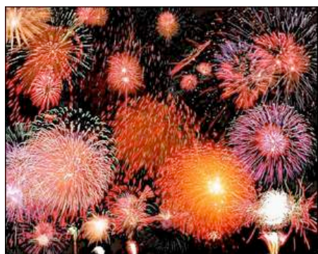
Celebrating the Fourth The Union photo children under 17. Information: 265-6124.